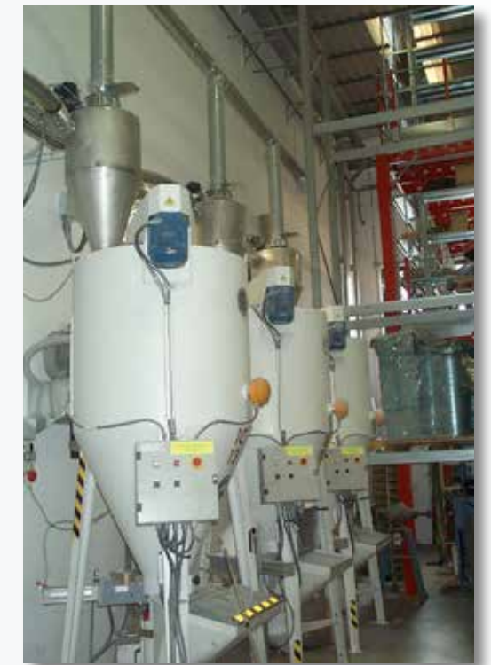
SPECIAL FORMULA MIXERS