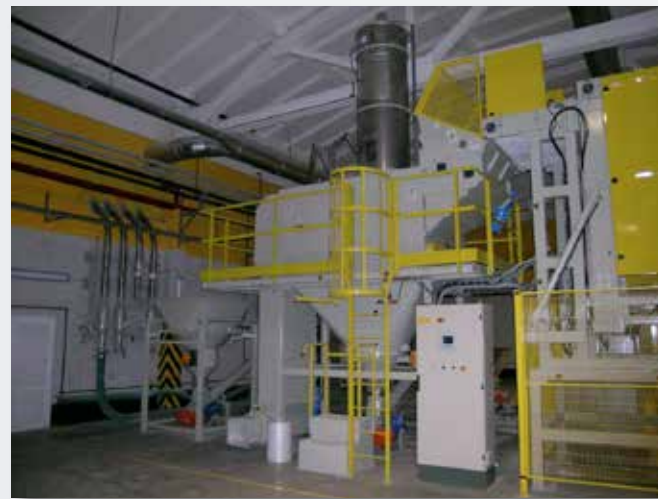
AUTOMATIC DEBAGGING SYSTEM