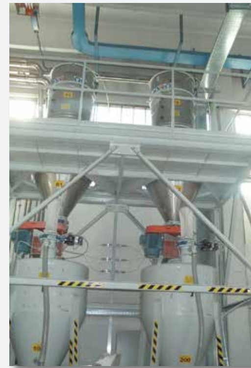
WEIGHING & MIXING SYSTEM