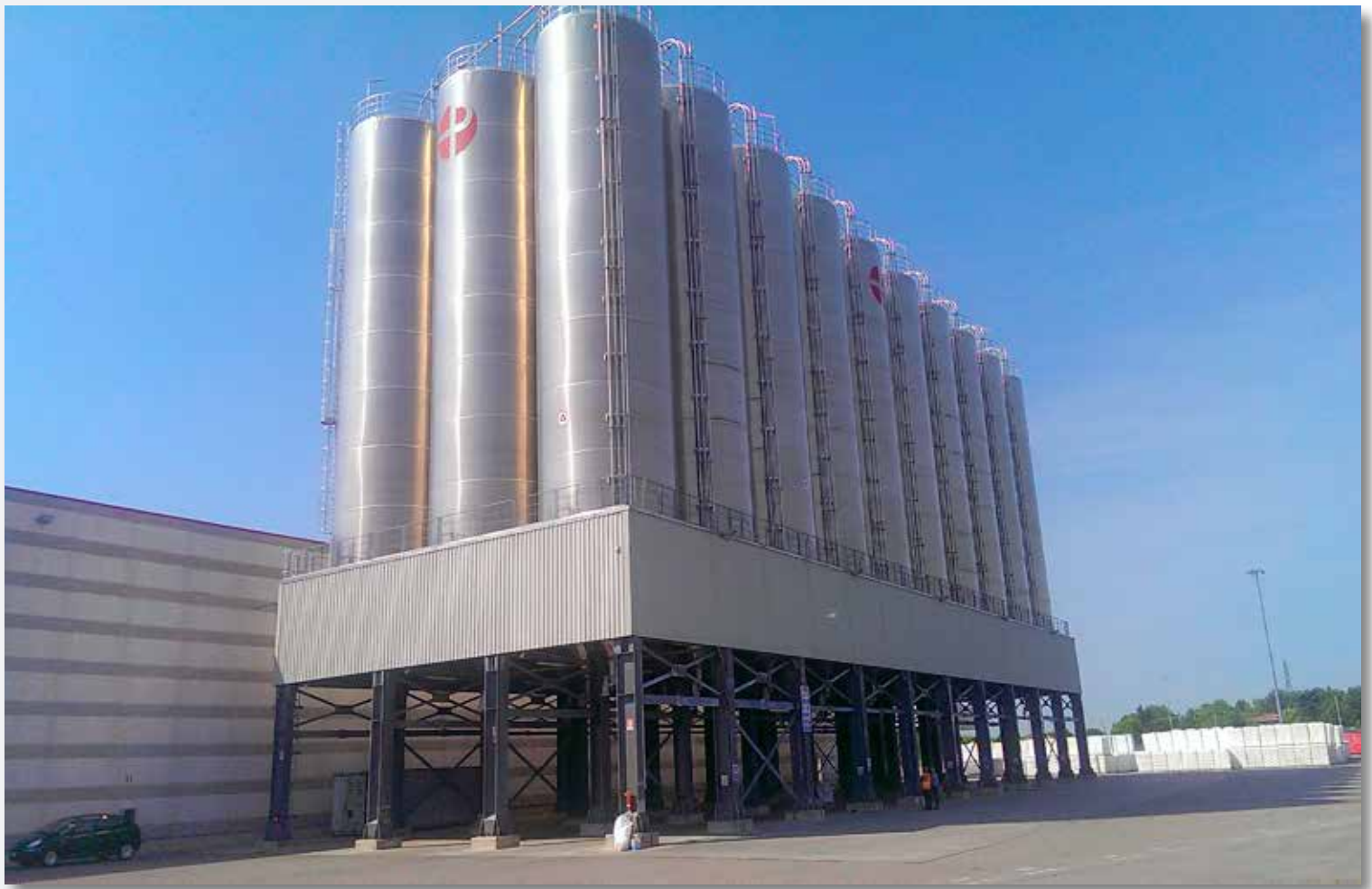
LARGE STORAGE PLANTS FOR RAW MATERIAL DISTRIBUTORS