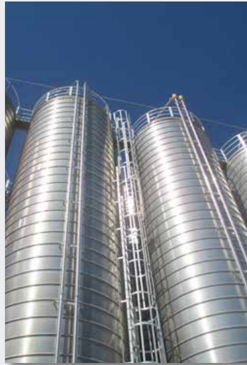
WELDED SPIRAL SILOS